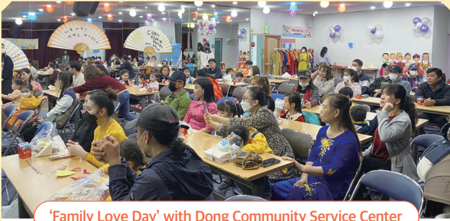
'Family Love Day' with Dong Community Service Center